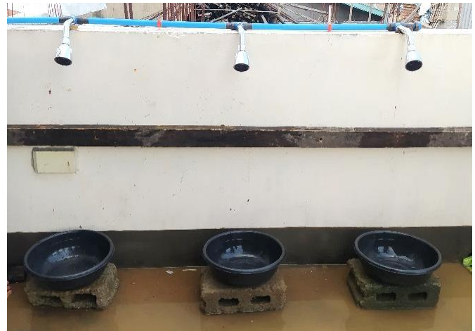
Fig. 13. Showerheads and basins for rainfall intensity.

The measured time it took for the showerhead to fill up a 95 mm container with water was used to calculate the average rainfall intensity used in the soil run-off simulation. Fig. 13 shows five trials for each of the three showerheads. A surface run-off test was conducted on a soil testbed with a 30° slope to simulate a run-off scenario using water as the primary agent of weathering and erosion [17]. Three soil testbeds with 865mm (l) x 445mm (w) dimensions were created. In Fig. 14, soil bed A was the bare soil, soil bed B was the soil with Coconet, and soil bed C was the soil with BafNet. For the erosion control test, an artificial rainfall which was water coming from three shower heads (one for each soil testbed), was installed 1 foot above and perpendicular to the top of the soil testbed. For 25 minutes, the rainfall intensity remained constant.