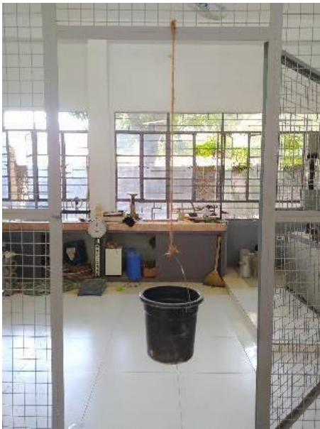
Fig. 12. A BSPF rope carrying a bucket.