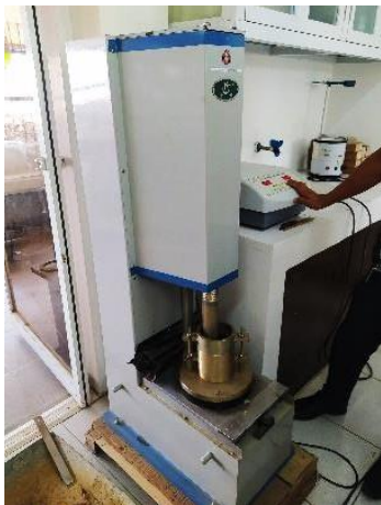
Fig. 7. Mechanical Compactor.

Method C of AASHTO T 99 was performed to determine the moisture-density relationship of the soil using a mechanical compactor, as shown in Fig. 7. This laboratory test established the relationship between the dry density and the soil's moisture content to understand the soil's compaction properties better. When soil is compacted to a dense state, it increases shear strength, improves the stability of slopes of embankments, decreases future settlements, and reduces permeability.