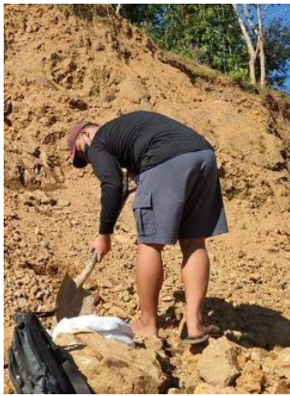
Fig. 1. Accumulation of Soil Samples.