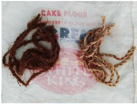
Fig. 11. BSPF ropes and coco fiber ropes are pat-dried with a clean cloth.

The tensile strength test was performed manually because the Universal Testing Machine (UTM) for fiber ropes is not accessible in the locality. Fig. 12 demonstrates a one-meter fiber rope carrying an empty bucket fastened to a horizontal rod 2 meters above the ground. Before the test, the mass of the empty bucket was recorded ( m_{\text{bucket}} ). Weights (sands) were gradually added to the bucket until the rope broke. The mass of the bucket with the weights (sands) was measured ( m_{\text{total}} ) at the breaking point. This method was applied to five BSPF ropes and five coco fiber rope samples. The tensile stress ( \sigma ) was computed using formula (2) wherein the net weight is computed using formula (3).