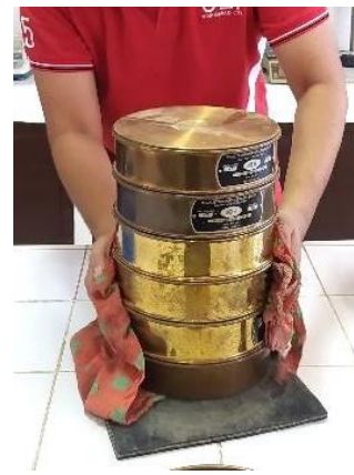
Fig. 9. Sieve Analysis.

The method described in ASTM C 136 and AASHTO T 27 covers the quantitative determination of the distribution particle sizes of soil was also tested. In Fig. 9, the soil was passed through a series of sieves, and the weight of soil retained in each sieve was determined and recorded. A gradation curve was drawn for each sample analyzed based on the percent finer weight.