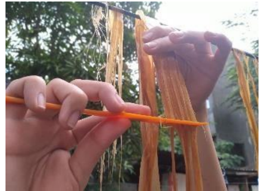
Fig. 3. Removing the impurities.