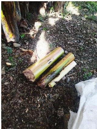
Fig. 2. Collection and preparation of Banana Pseudo-Stems.

The banana plantation was visited in Rizal, Cagayan, to ask permission from the owner to get some of the banana (Saba) trees that have been harvested. It was cut into one-meter lengths and transported to Tuguegarao City for preparation in Fig. 2. This process helped the owner reduce the agro-waste by converting it into more useful materials such as the net.