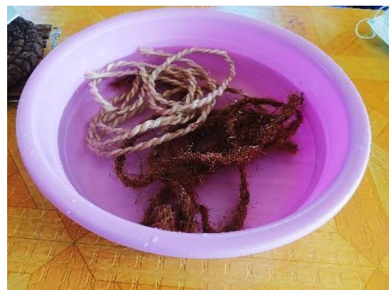
Fig. 10. BPSF ropes and coco fiber ropes soaked in water for 24 hours.