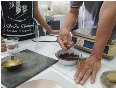
Fig. 8. Liquid and Plastic Limit Test.

Another test conducted for the soil samples focused on the Liquid Limit and Plastic Limit as defined in ASTM Standard D 4318. The moisture content required to close a distance of 12.7 mm along the bottom of the groove after 25 blows is the Liquid Limit. On the other hand, the moisture content at which the soil crumbles when rolled into 3.0 mm threads is known as Plastic Limit. Soil with a smaller diameter breaks due to wet soil, while a larger diameter soil breaks due to dry content. Fig. 8 shows the materials needed in this procedure.