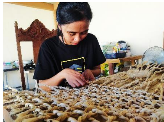
Fig. 6. The weaving of ropes.

After extracting the BPSF, a single rope was manually fabricated. Fig. 5 shows a single rope made by braiding two